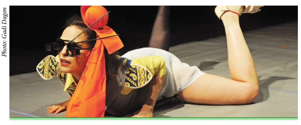
The Five W's / This is the Land /

This is the Land – The Zionist Creation Rejects' Saloon Created by Eyal Weiser, at Tmuna Theatre